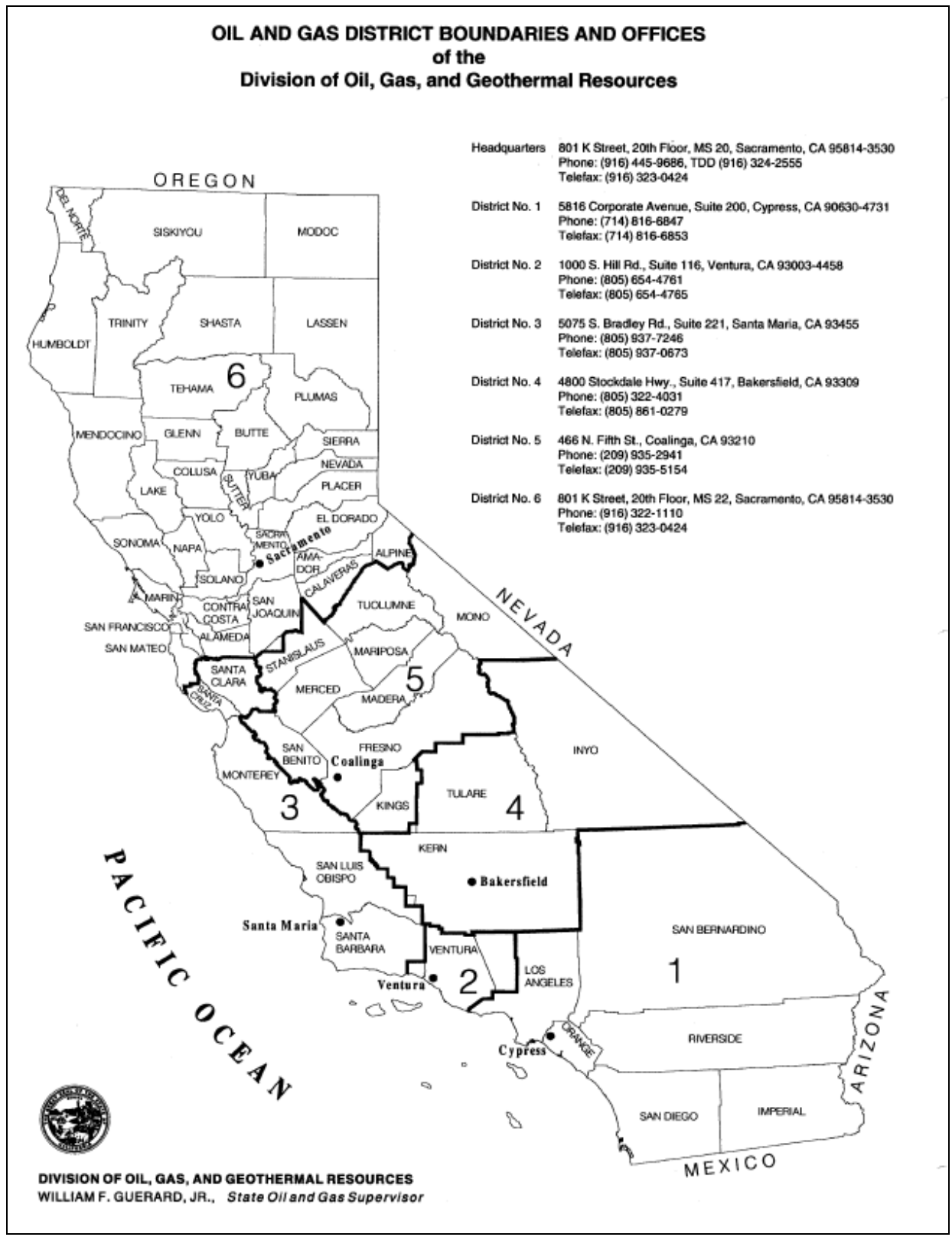
Figure ES-1. Map of CDOGGR Districts and District Offices